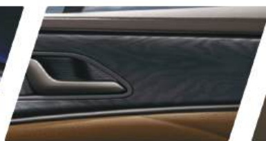
Genuine Wood Panel Touch of Nature.