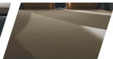
Soft air mattress designed for the boot.