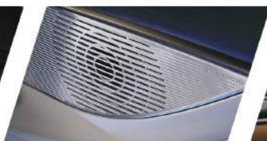
Dynaudio speaker HIFI-class sound system.