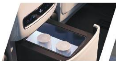
Beverage cabinet with cooling and heating function.

Our extra-large panoramic sunroof brings in natural light, making the cabin exceptionally bright, thoughtfully paired with double-layer glass that blocks 99% of UV rays.