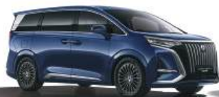
Whale Sea Blue